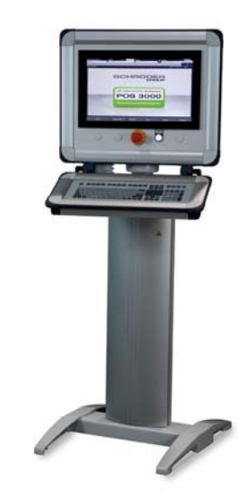
Panel with POS 3000 3-D software control

Lightbarriers, movement- and touch sensors ensure safe operations of the bending center.