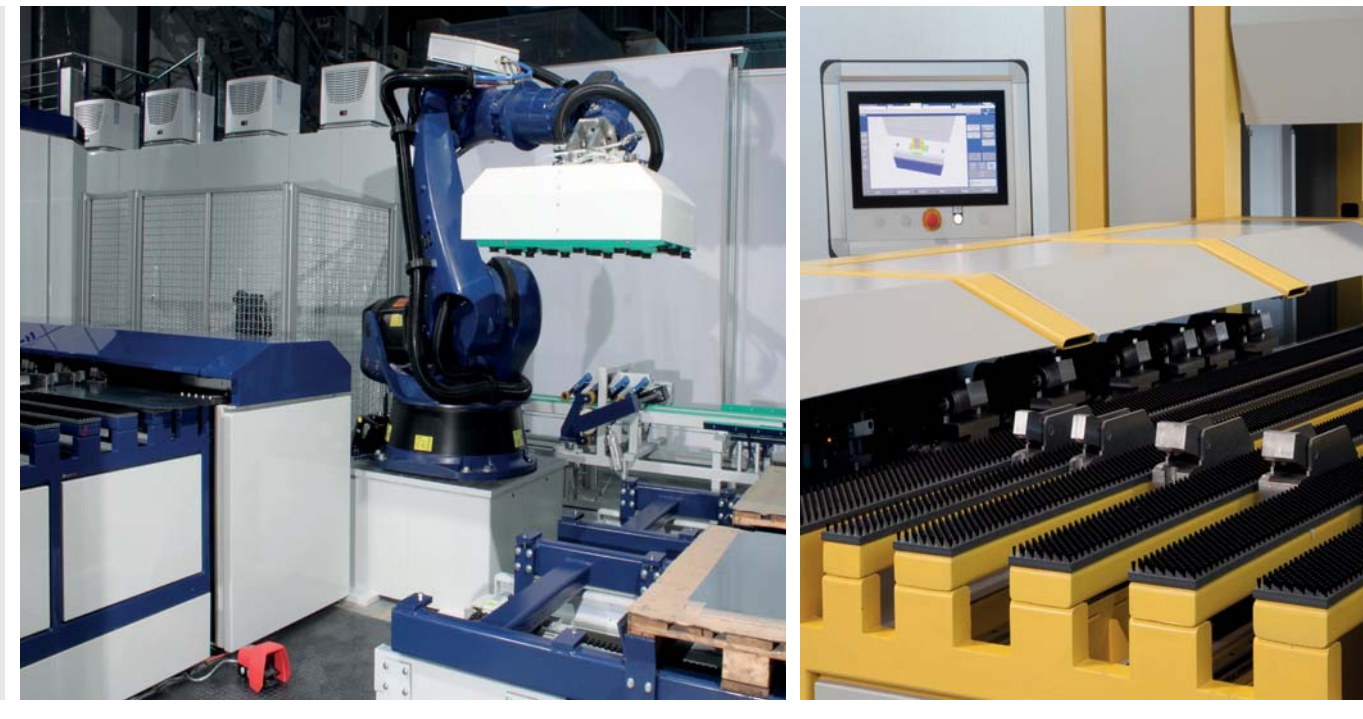
Kuka-Roboter in operation: The sheet gets picked up via suction units

In order to automate production processes we rely on established suppliers of reliable components.