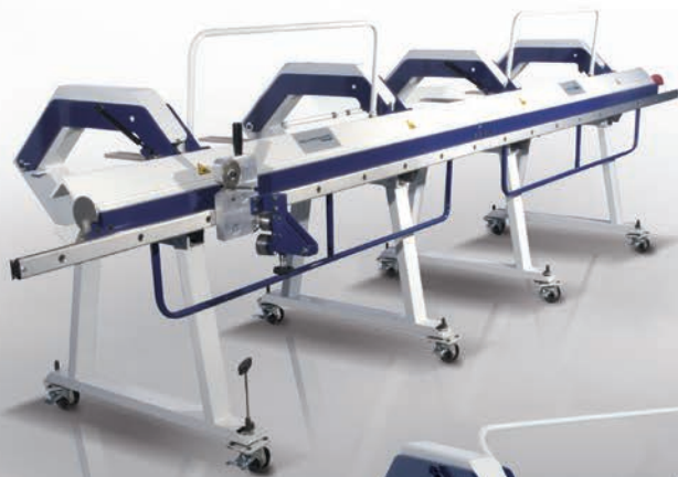
MODULAR 2000 basic module and extension

MODULAR is the combinable, modular folding machine from Schröder that enables profiling of any length of sheet metal – directly at the construction site.