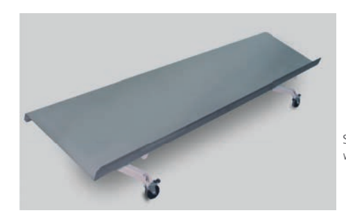
Sheet shute on wheels with 4 steering castors

In order to ensure the most efficient operation, you can acquire the manual back gauge which is adjustable from the front and has a digital readout. With this option the operator does not need to walk around the machine as he can easily adjust the gauge directly from the front. Also here, the sheet support in connection with the sheet shute completes the system.