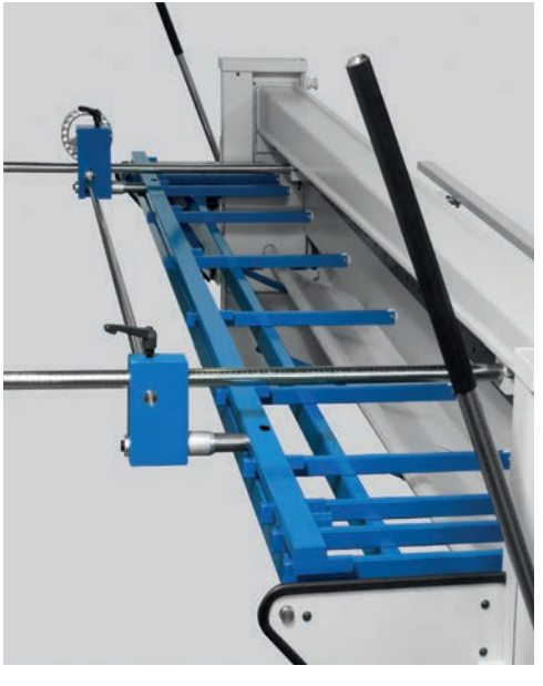
Optional: Mechanical sheet support for manual back gauge Optional: Manual back gauge adjustable from the front